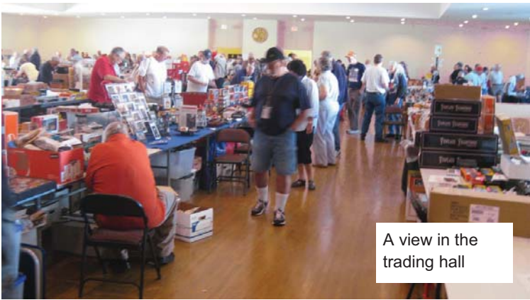
A view in the trading hall