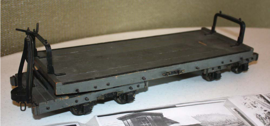
Richard Zanotti brought in this Bing 1 gauge lumber flatcar, possibly a factory prototype. It has working brakes (see lever at near end).