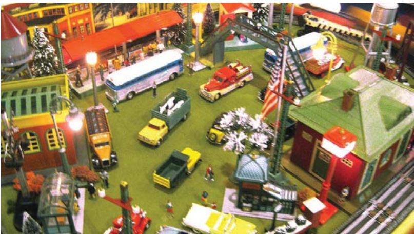
Three Photos: The display layout of Grieg Muselman. Below: Another display layout.