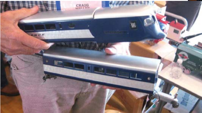
Above: These are two of the three car set (two end units and a center car) of the Consolli Bros. standard gauge model of the New Haven RR Comet. The motors are in each of the two vestibule units. Ira is going to replace the motor units with improved units of his own design.