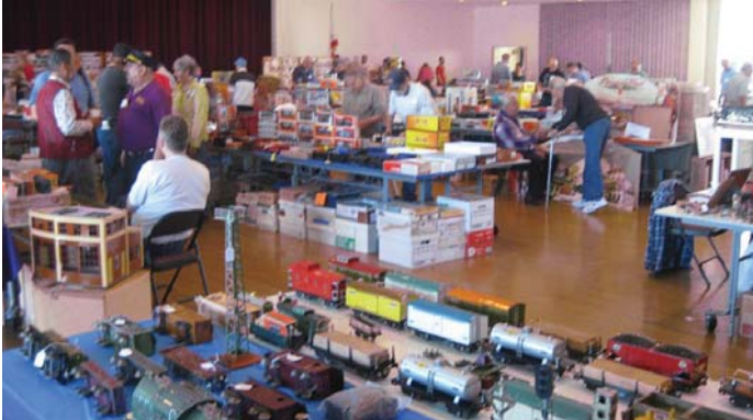
Scene in the trading hall